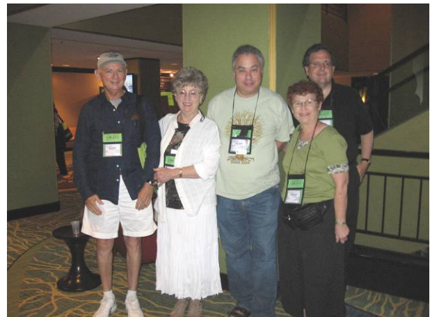
A few JGSGW members who made it to the photo-shoot at the IAGJS Chicago.