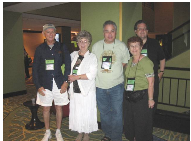
A few JGSGW members who made it to the photo-shoot at the IAGJS Chicago.